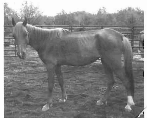
A thin horse with a body condition score of less than 3 lacks the needed onboard fuel for endurance competition.

tion rates are noticeably higher (see sidebar) in horses with a condition score of between 4 and 5—that is, with enough fat layer to cover the ribs and topline to create a smooth silhouette, without being significantly either overweight or underweight.