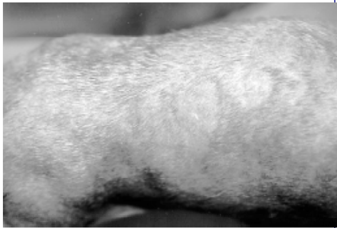
Lesions on a dog give a patchy appearance.

Exhibitors should understand that any animal with suspicious