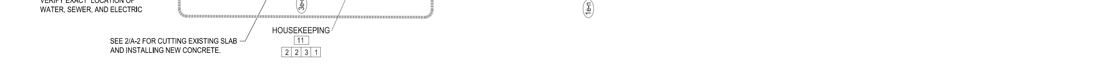
FLOOR PLAN BASE BID