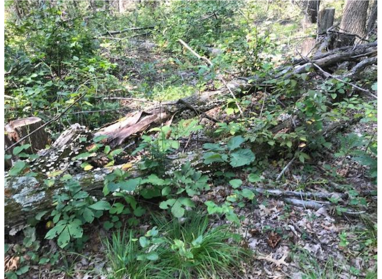
Oak Restoration Work Along Mason Ridge Hiking Trail

You may have noticed in multiple places throughout Yellowwood and Morgan-Monroe State Forest where the understory of the forest has been “opened up”. Oak-hickory forests are facing drastic changes from the herbaceous plant layer all the way to the top of the canopy. This is due to other species, mainly beech and maple, encroaching into oak forests. This shades out oak and hickory regeneration, beneficial native shrubs, and a large diversity of herbaceous plants. Prescribed fire and mechanical cutting/spraying are two methods for restoring these extremely important ecosystems. More of this work is planned in 2021.