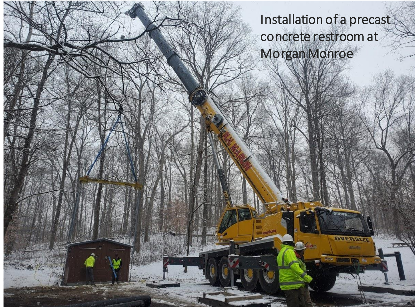
Installation of a precast concrete restroom at Morgan Monroe

Installation of 4 new precast concrete primitive restrooms at Mason Ridge, Oak Ridge, and Cherry Lake