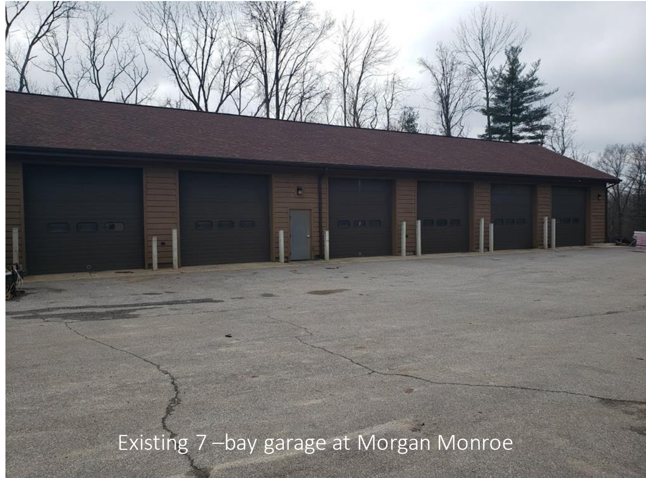
Existing 7 –bay garage at Morgan Monroe

A new 7-Bay garage will be constructed in the service area at Morgan-Monroe State Forest.