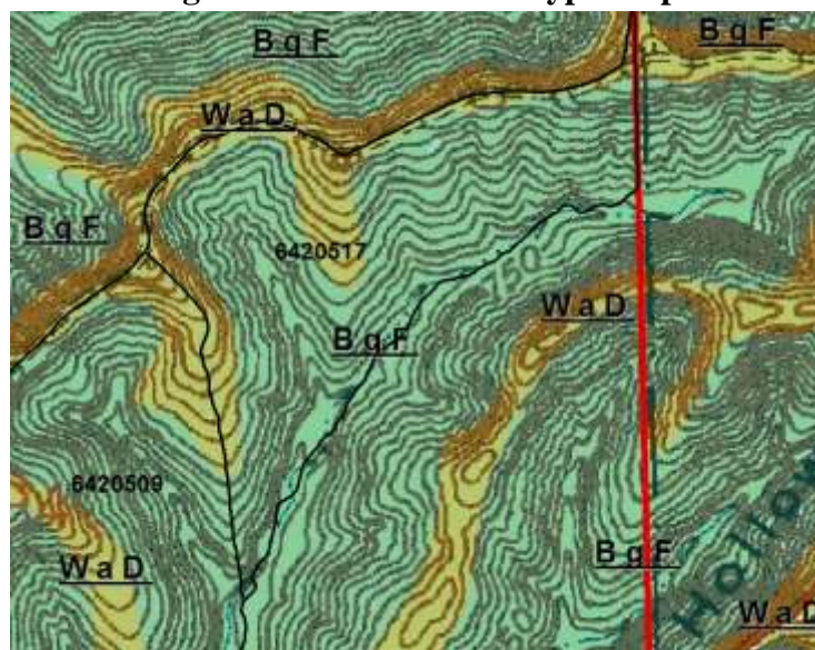
Figure 2. – 6420517 Soil Type Map

These moderately steep to very steep well drained soils are on hillsides in the uplands. They are fairly well suited to trees. Erosion hazards and equipment limitations are main management concerns due to slope. Consideration should be given during sale planning and implementation of Best Management Practices for Water Quality. This complex has a site index of about 70 for northern red oak.