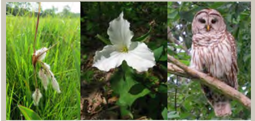
Common cottongrass, trillium and barred owls are among many species that call Moraine home.