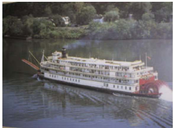
Delta Queen steamboat

8. Take the students on a field trip to visit the McAlpine Locks. Besides watching the operation of the locks, the students can become familiar with the history of the river canal and the building of the locks from the display in the visitor center. [Note that there is limited access during construction of the new 1,200-foot lock chamber.