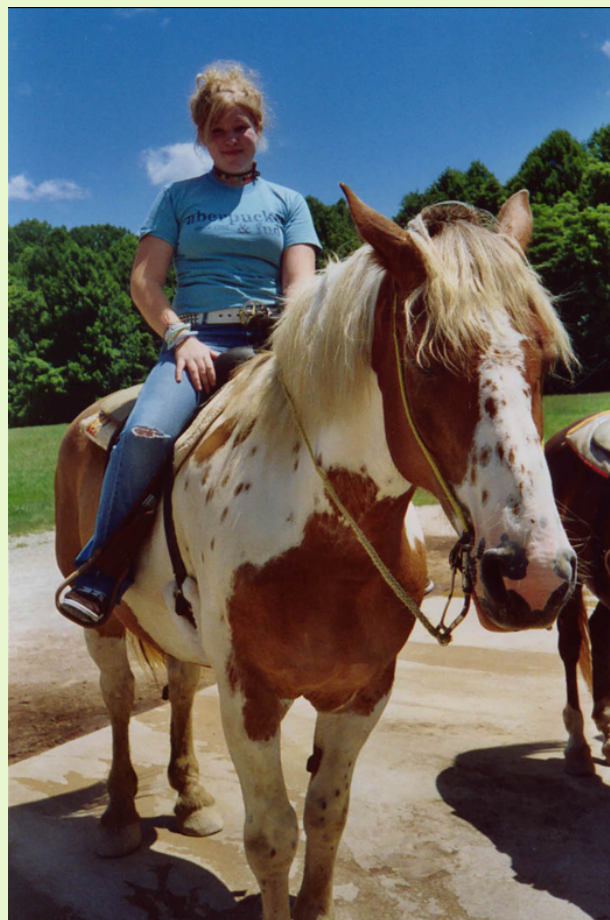
Looks like this rider enjoyed her experience on Sam by the big smile on her face!