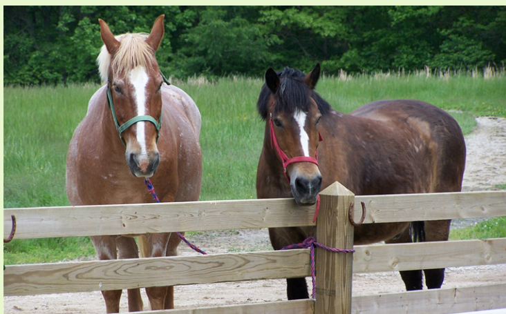
George and Duke are just hanging out at the saddle barn. Their owner wants you to put them to work!