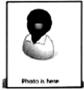
Photo is here

Pursuant to the accompanying travel packet (for international flights) or the form I-94 (for U.S. domestic flights), the Department of Homeland Security/U.S. Citizenship and Immigration Services has approved the application to apply for admission to the United States of the below-named alien(s) under section 207(c)(1).