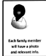
Each family member will have a photo and relevant info.