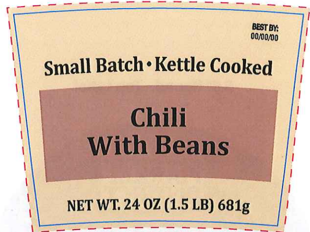
3.125" (W) x 2.325" (H) - Front Label