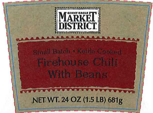
3.125" (W) x 2.325" (H) - Front Label