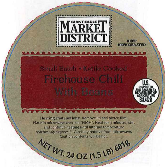
3.5" Round - Top Label