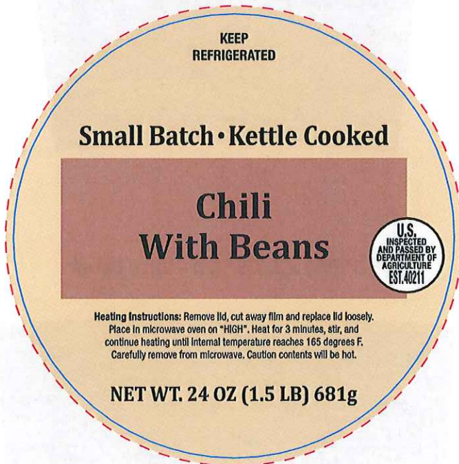
3.5" Round - Top Label