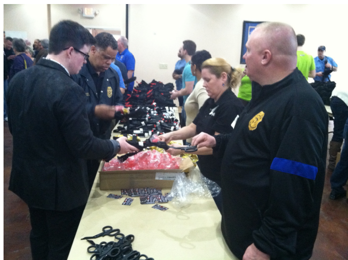
Volunteers assemble trauma kits on March 10

On Monday, March 10, The Father's House, a non-denominational Christian church in Indianapolis, and local first responders assembled the remaining 950 of 1500 Trauma Kits for Indianapolis Metro Police Department Officers. This completes their goal of equipping every IMPD officer with a Trauma Kit. The Father's House created a Facebook Group, "Trauma Kits for Police Officers," where they share how they assembled the kits, including specifically where they purchased each item because they do not recommend ready-made kits. The items in these custom Trauma Kits were researched by a team consisting of police officers, firefighters, and EMTs. The kits consist of: small medical pouch, large trauma shears, a C-A-T tourniquet, 6" OLAES Modular Bandage and an oral airway. Each kit costs about $100. On the same Facebook group page, there are examples of the positive impact these kits have had on local communities. If you are interested in finding out how you can bring Trauma Kits to your local first responders, contact FOP Lodge #86 at 317-637-1195 or visit www.fop86.org .