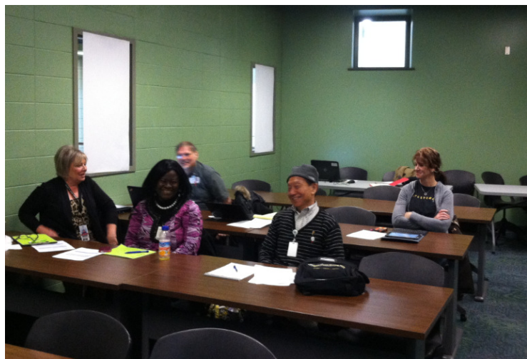
Attendees at the training event in Fort Wayne on March 25

The ISDH Trauma and Injury Prevention Division planned statewide training events for all those required by the rule to submit data. In February, ISDH staff traveled to Terre Haute, Evansville, Scottsburg, Columbus, and Indianapolis. We trained 52 users from 26 facilities on the hospital side and 34 users from 20 services on the EMS side on submitting data to the Registry. During March, staff traveled to Anderson, Fort Wayne, South Bend, Crown Point, and Lafayette. We trained 46 users from 28 facilities on the hospital side and 44 users from 30 service providers on the prehospital side for the Registry. The division is still hosting training events at the ISDH building at 2 North Meridian Street in Indianapolis. If you are interested in attending a training event, visit: http://www.in.gov/isdh/26127.htm .