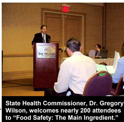
State Health Commissioner, Dr. Gregory Wilson, welcomes nearly 200 attendees to “Food Safety: The Main Ingredient.”

Region Food Specialist with FDA, was a highlighted speaker on Day Two of the workshop, with a discussion on plumbing and backflow prevention, and dish machines. As a special added topic, Pratt also talked about how FDA inspectors handled inspections at the Olympic Games in Utah, where nearly 150,000 meals were served from temporary facilities.