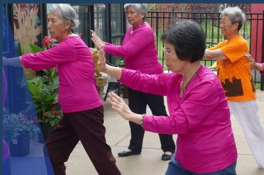
A group of older adults practices the evidenced fall prevention martial arts practice of Tai Chi.

Each year more than one out of four older adults fall. Every 11 seconds, an older adult is treated in the emergency room for a fall. Every 19 minutes, an older adult dies from a fall. Falls, with or without injury, can carry a heavy quality of life impact. Older adults who have or have not fallen fear falling, and limit their activities and social engagements. This can lead to depression, social isolation and feelings of helplessness.