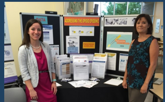
The Prescription Drug Overdose information booth is set up at a conference.