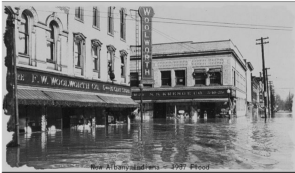
New Albany, Indiana - 1937 Flood