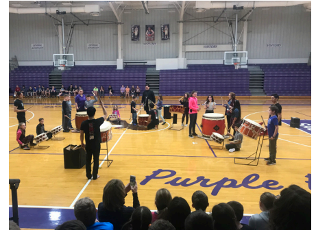
Ondekoza - Arts Midwest World Fest & The Indiana Arts Commission