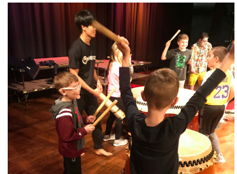
Ondekoza - Arts Midwest World Fest & The Indiana Arts Commission