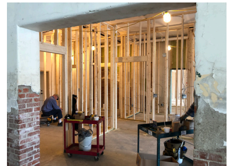
J.J. Bulleit Building Progress