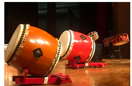
Ondekoza - Arts Midwest World Fest & The Indiana Arts Commission