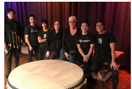
Ondekoza - Arts Midwest World Fest & The Indiana Arts Commission