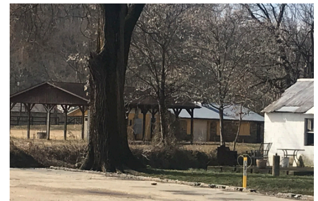
Rice Island Existing Conditions