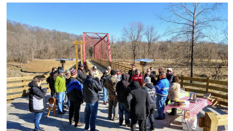
Indian Creek Trail Opening