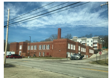
Corydon School Senior Lofts Construction Progress