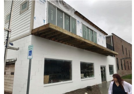
Beanblossom Building Phase Two Underway