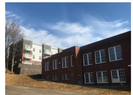
Corydon School Senior Lofts Construction Progress