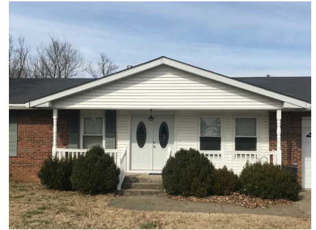
Completed Home with Owner-Occupied Program