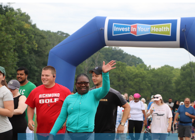
One of the new additions to the 2020 Run the State 5K and Hike Series is a hike at Fort Harrison State Park. This year's grand finale takes place Aug. 15 and will feature a 5K as well as a hike.

Be sure to keep an eye on investinyourhealthindiana.com all season long for event photos, wrap-ups, and more.