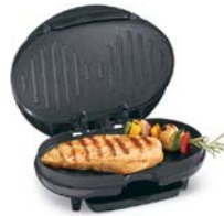
Healthy Indoor Grill