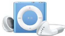
2GB iPod Shuffle