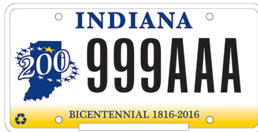
The Bicentennial license plate, featured above, is now the standard for all Indiana passenger vehicles.