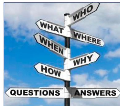
The SIC provides quality customer service regarding state programs and services.