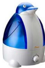
Cool Mist Humidifier