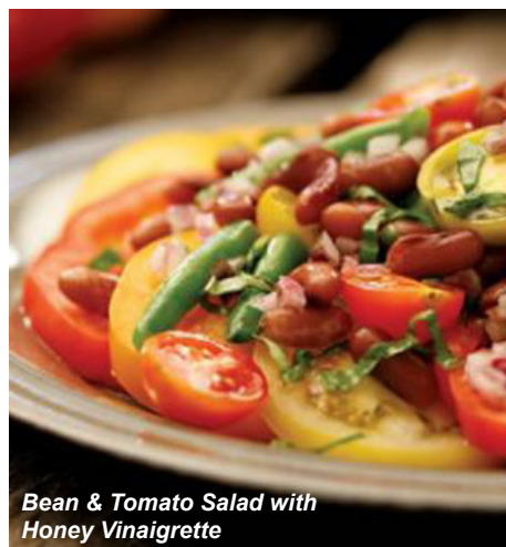
Bean & Tomato Salad with Honey Vinaigrette