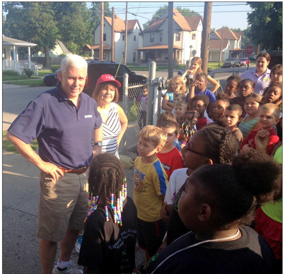
In Terre Haute, Governor Mike Pence and First Lady Karen Pence speak with kids from the Chestnut Community Center prior to the second "Walk a Mile" event to promote fitness and health among Hoosiers. To see more pictures of Governor Pence, visit http://in.gov/gov/2387.htm

Motorists, residents and businesses are encouraged to visit www.SouthSplit.in.gov to learn details of the project and sign up for project email updates. Updates will also be provided on the Indiana Department of Transportation East Central Facebook page and on Twitter @INDOT_ECentral .