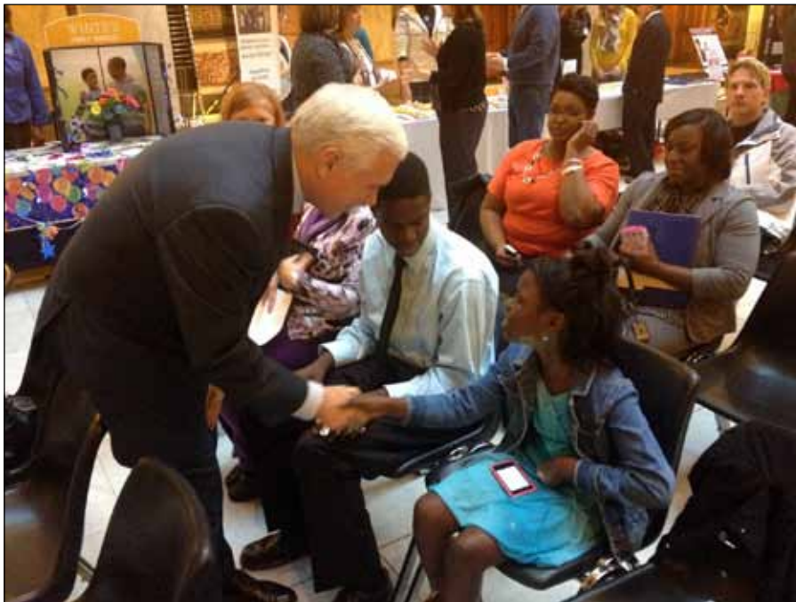
On Nov. 13, Governor Pence greets attendees of the first-ever Governor's Information and Awareness Adoption Fair, which brought together more than a dozen adoption organizations to provide resources for adoptive and potential adoptive families. To see more pictures of Governor Pence, visit www.in.gov/gov/2387.htm

For more winter driving safety tips, visit www.winterdrivingsafety.in.gov .