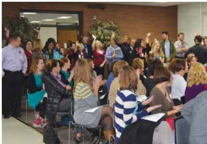
On Oct. 24 Members of the Center for Deaf and Hard of Hearing Education transition team raise their hands at the Center's grand opening.

Camping gift cards are available at property offices and at camp.IN.gov , and additional gifts for outdoors lovers are sold at InnsGifts.com .