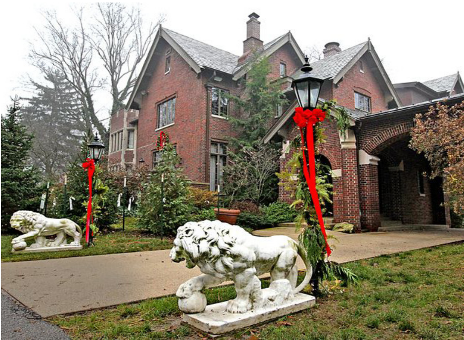
The Governor’s Residence, located on North Meridian St., is the sixth official governor’s residence. The Governor’s Residence Commission acquired the six and one half acre estate in 1973 to serve as the official Governor’s Residence. Approximately 10,000 people visit the Governor’s Residence each year.