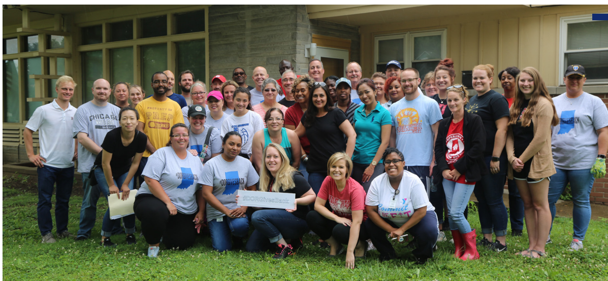
Seen here are Indiana Department of Revenue employees and interns who participated in the #DORGivesBack program at HVAF, Indianapolis.