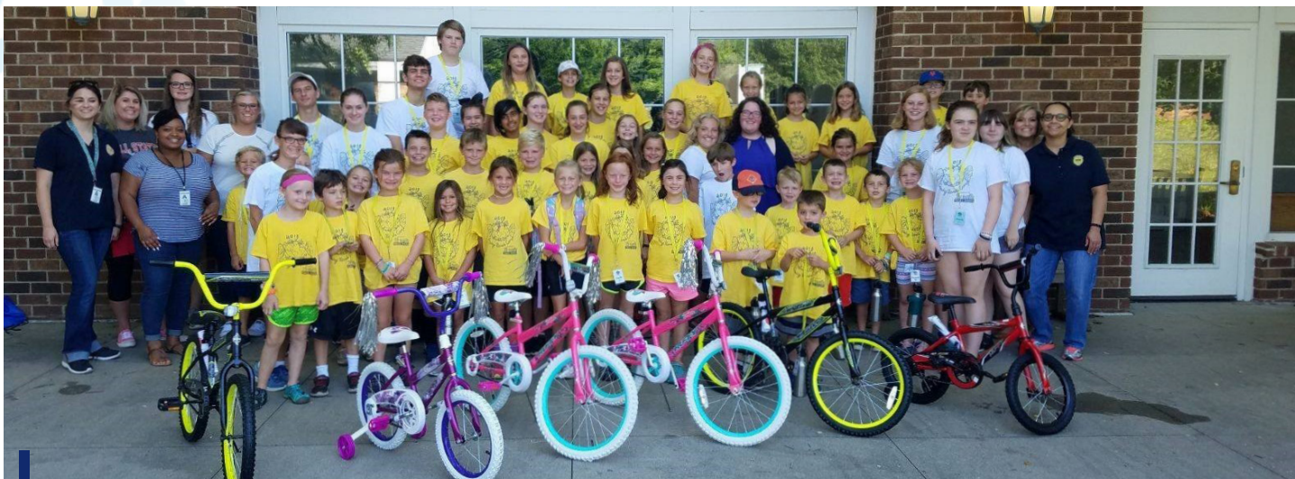
The #DORGivesBack program saw Indiana Department of Revenue employees build bicycles for foster children.

commissioner explained. “By helping families fulfill their dreams of entering newly-constructed homes, enabling veterans to enjoy a freshly-landscaped yard, and delivering bicycles to foster children, the DOR family has been able to bring smiles to the faces of those we serve in our traditional role.”