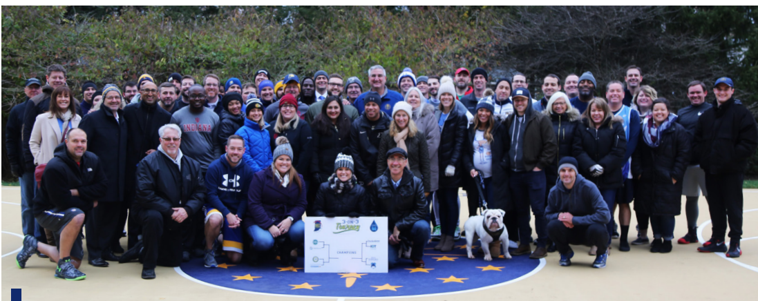
The 2018-19 Indiana SECC season was capped off with a 3-on-3 basketball tournament at the Indiana Governor's Residence Nov. 9. A team representing Gov. Eric Holcomb won the tourney, which was organized to raise money for this year's chosen charity, Project 44.