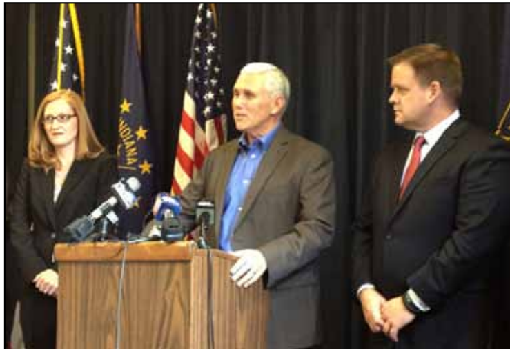
Governor-elect Mike Pence announces his cabinet appointees at a press conference on Dec. 5, 2012.