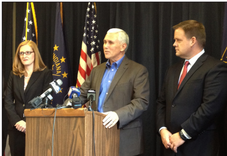
Governor-elect Mike Pence announces his cabinet appointees at a press conference on Dec. 5, 2012.