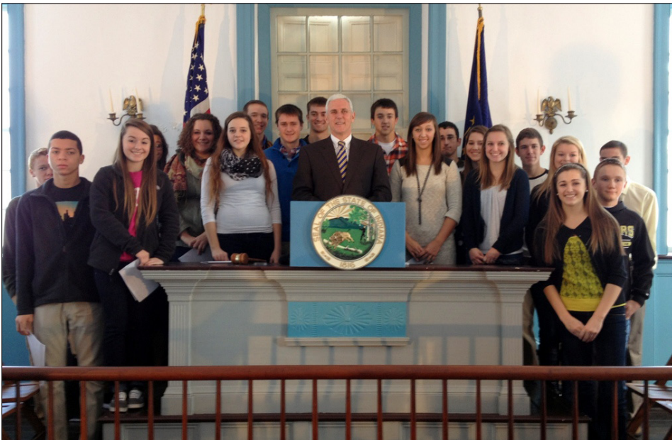
December 10, 2013: On the eve of Indiana's 197 th birthday, Governor Mike Pence joined Hoosier students in Corydon, the home of Indiana's first state capital, to detail his 2014 education agenda. For more information on the Governor's 2014 Roadmap, visit www.in.gov/gov/2680.htm .

Enrollment is limited for each type of training, so enroll today by logging into PeopleSoft ELM. Instructions on how to register are posted above or online at in.gov/spd/2391.htm . Questions can be directed to spdtraining@spd.in.gov and additional training information for state employees can be located at www.in.gov/spd/2331.htm