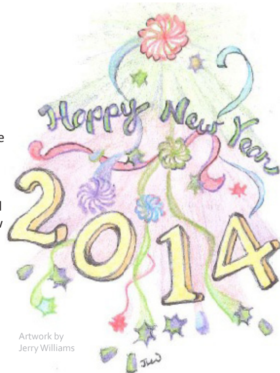
Artwork by Jerry Williams

"We still urge these Hoosiers to take action now to enroll in a health plan that will cover them in 2014," added Minott. "The federal marketplace will require an application and payment long before the end of April. Also, the plans available on the marketplace all have annual deductibles which will start in January. It will help Hoosiers in the long run if they begin paying on their annual marketplace plan deductibles sooner rather than later." FSSA is reaching out by mail to all the HIP members expected to transition off HIP letting them know about the temporary extension and transitioning to the federal marketplace, and is encouraging them to call the Healthy Indiana Plan at 1-877-GET-HIP9 for help.