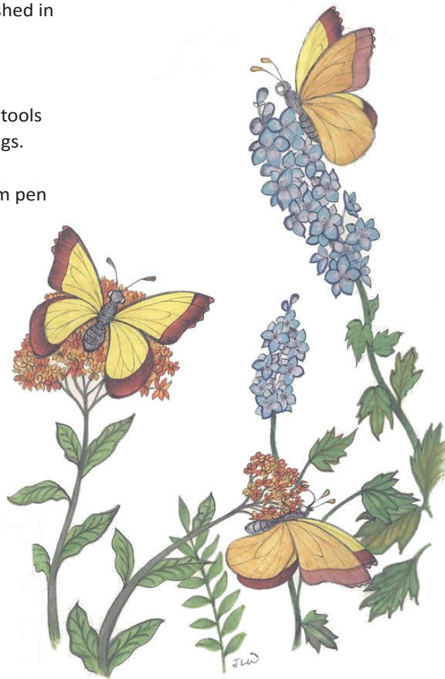
July 2012 submission

movement- you don't get the same effect if you use a straight line. Circles are better for blending colors and lines don't tend to want to merge."