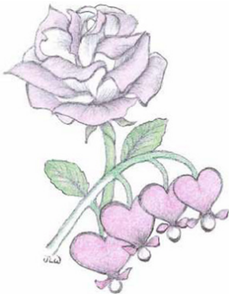
February 2014 submission

admits not all drawings are easy for him, especially flags. Capturing the windblown fabric and including every star often present a minor challenge for him. He also doesn't enjoy drawing people.