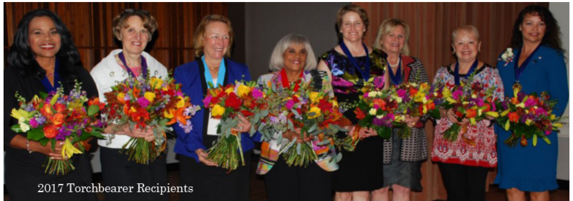
2017 Torchbearer Recipients

Recipients are selected from a pool of nominated candidates who have overcome adversity, made extraordinary contributions, or been pioneers throughout their lives. Selection is based on the recipients' demonstrated achievement in the areas of their professional careers, community leadership, and/or public service. Recipients must be living at the time of their nomination.