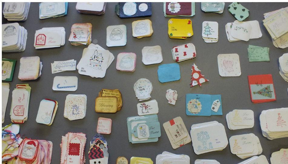
An onsite vocational center at Logansport State Hospital helps patients earn money by creating greeting cards.