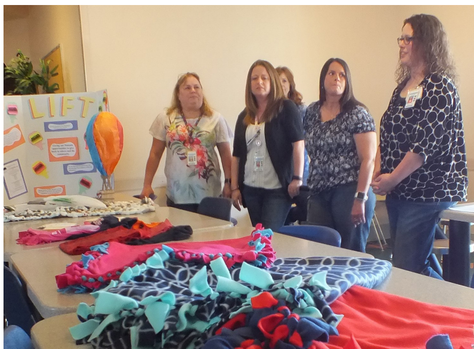
Staff of Logansport State Hospital involved with the L.I.F.T. program displayed some of the items created through the community service effort. Among those are totes made from old t-shirts, mats fashioned out of plastic sacks, and no-sew blankets.