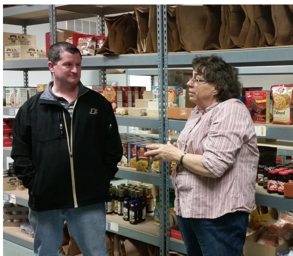
In April 2017 Logansport State Hospital's Helping Hands committee donated food to the Salvation Army which was used for the facility's Easter meal.