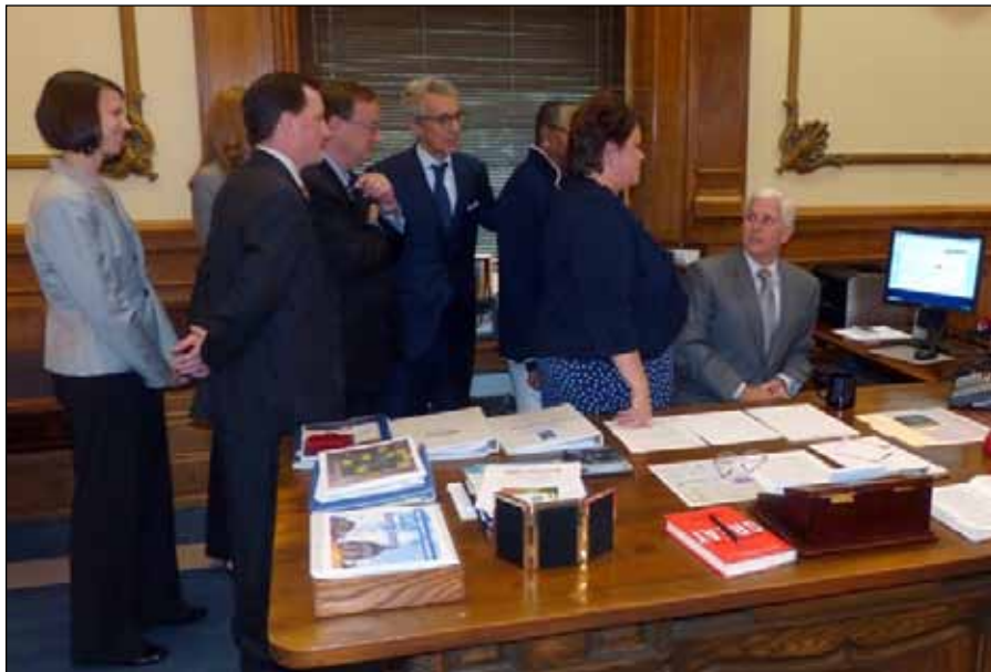
On June 3, Governor Mike Pence joins representatives from Castlight Health, Indiana University, Cummins, Anthem and the Indiana State Personnel Department to discuss and sign up for Castlight.

On Monday, Governor Mike Pence launched a new healthcare transparency tool, Castlight Health, bringing long-awaited cost and quality information to State of Indiana benefit plan members. The Governor, along with leaders from Castlight and Anthem, completed several searches and discussed the importance of transparency.