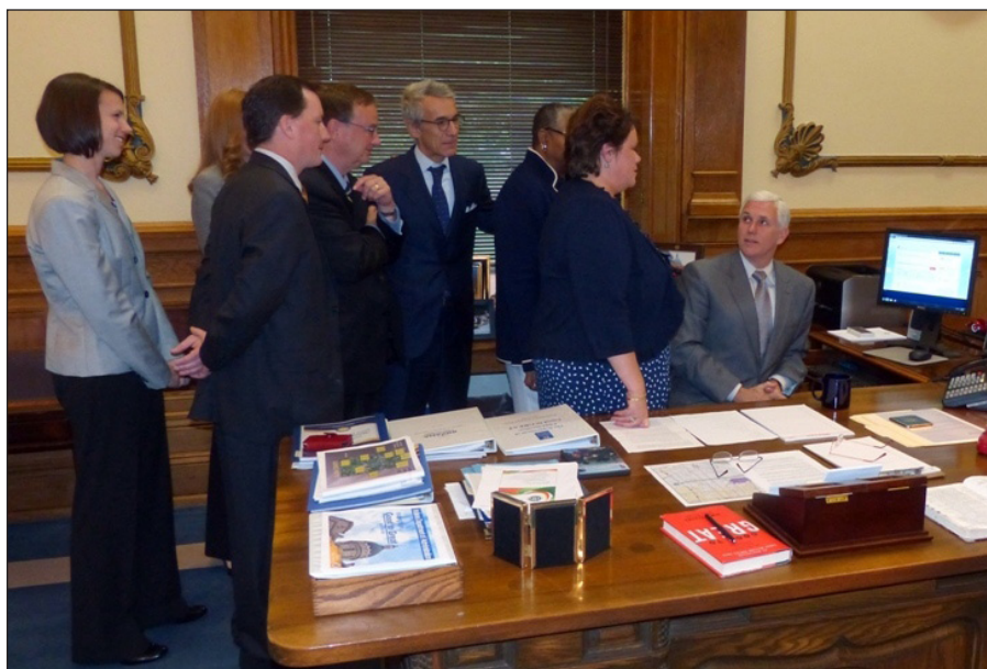
On June 3, Governor Mike Pence joins representatives from Castlight Health, Indiana University, Cummins, Anthem and the Indiana State Personnel Department to discuss and sign up for Castlight.

Indiana is first to offer benefit that lets employees compare cost, quality of healthcare