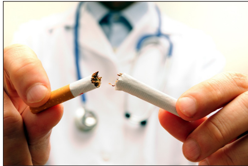
More than one million Indiana smokers and research indicates 80 percent of Hoosier adult smokers wish to quit.

Tips 2013 urges tobacco users to make a quit attempt, with a specific piece aimed at encouraging smokers to talk with their doctor. The piece, titled “You Can Quit. Talk with