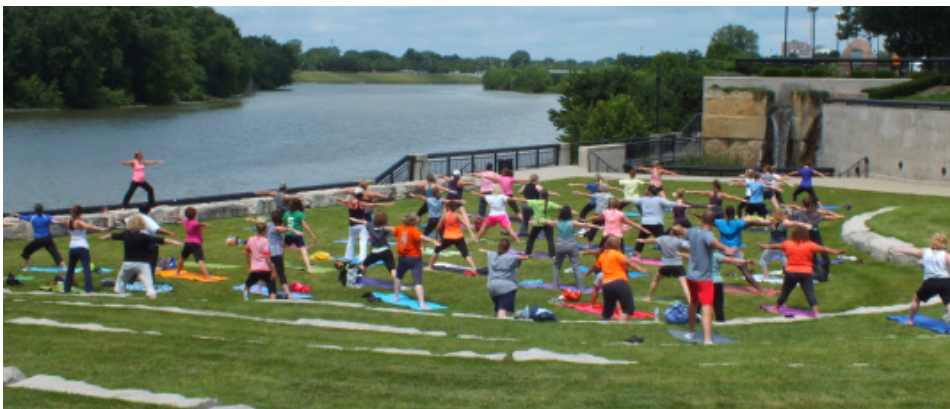
Health and Wellness Week yoga at White River State Park

For the past few years, state employees have enjoyed an annual month-long celebration of health and wellness each July. The biggest event of the month is the statewide steps challenge hosted in HumanaVitality July 1 through July 31, with registration beginning on June 15. Start planning now to join a team of your friends and co-workers to see how your team stacks up against other state employees.