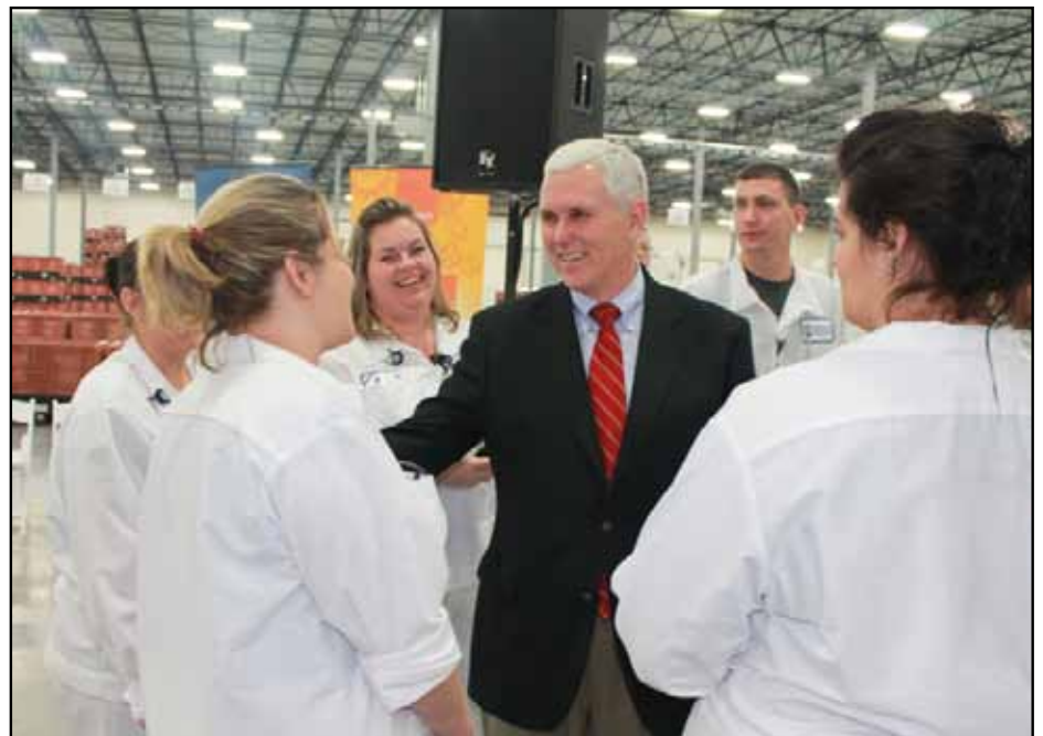
Governor Pence speaks with employees of Greenville Technology, Inc., one of Honda's largest suppliers of plastic components in North America, for a ribbon cutting ceremony for the company's first Indiana facility in Anderson.

Get ready to trade an hour of sleep for more sunshine later in the day. Welcome to daylight saving time! Daylight Saving Time begins at 2:00 a.m. on Sunday, March 10.