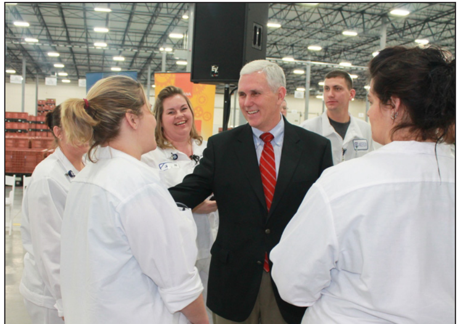
Governor Pence speaks with employees of Greenville Technology, Inc., one of Honda's largest suppliers of plastic components in North America, for a ribbon cutting ceremony for the company's first Indiana facility in Anderson.

Get ready to trade an hour of sleep for more sunshine later in the day. Welcome to daylight saving time! Daylight Saving Time begins at 2:00 a.m. on Sunday, March 10.