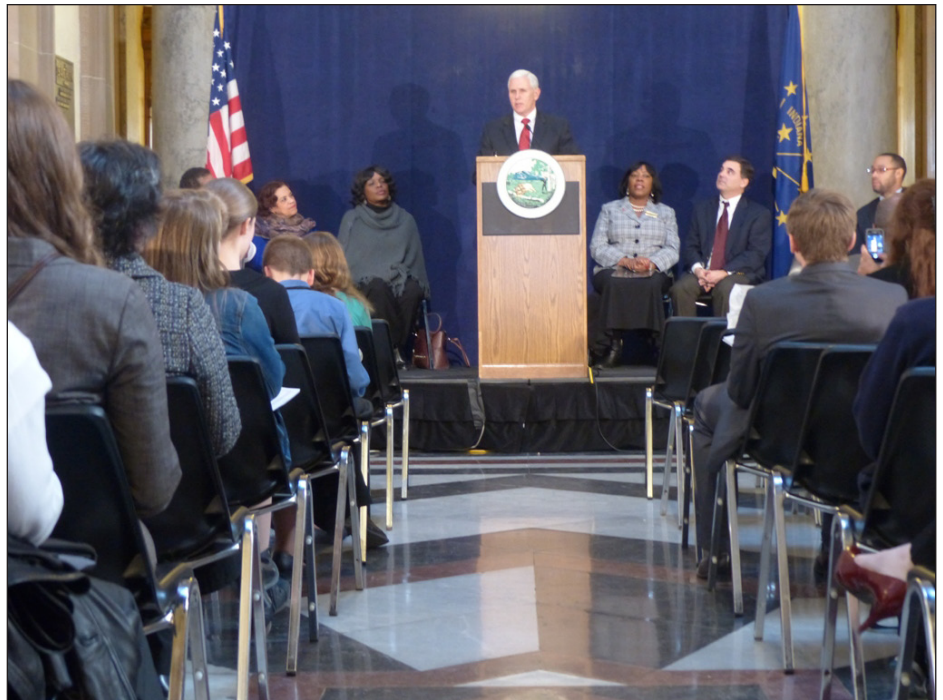
On February 11, Governor Mike Pence joins Hoosiers and representatives of the Indiana Civil Rights Commission for Indiana’s Black History Month Celebration in the Indiana Statehouse. To see more pictures of the Governor, visit in.gov/gov/2387.htm .