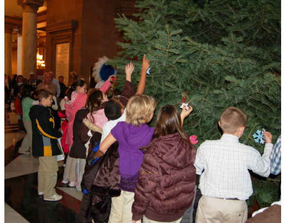
Students from across Indiana decorate the 2012 Rotunda Christmas tree.

State House Tour Office 200 W. Washington St, Rm 220 Indianapolis, Indiana 46204