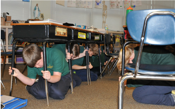
Students in an Evansville elementary practice an earthquake drill.

Indiana has led the pack with more registrations than any other central U.S. state for the past several years. Let's keep the record going!