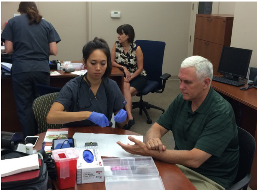
Governor Pence and First Lady Karen Pence receive their Vitality Check to help them attain Silver Status.

Winners will be notified via phone, email or express mail on or about September 10, 2015. Each potential daily winner must respond within 10 business days to claim his or her prize. The grand prize contest winner will be selected on September 28.