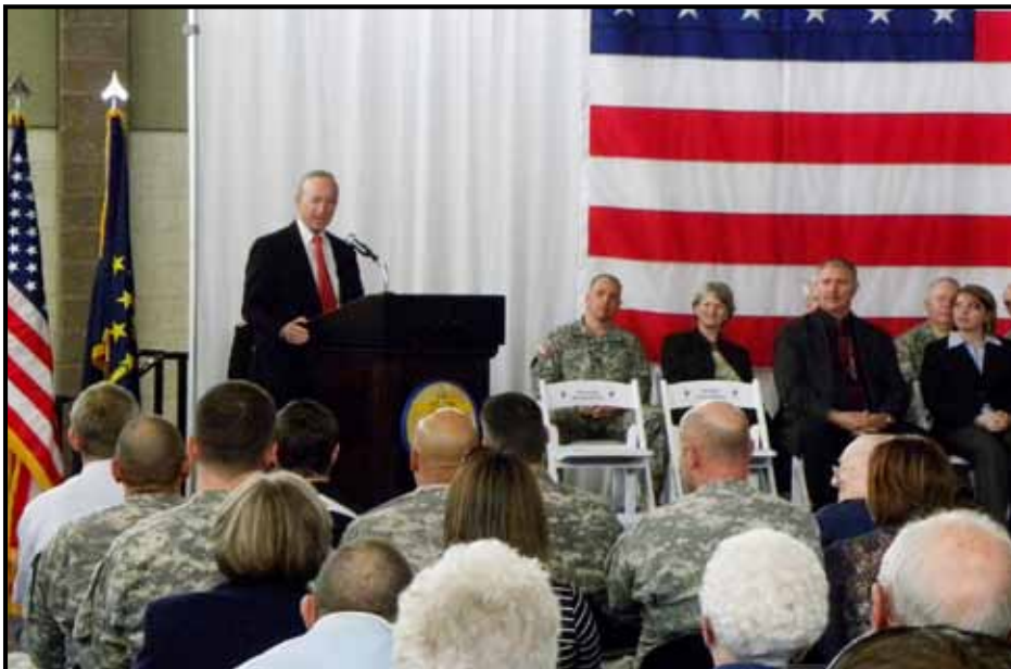
Governor Daniels makes remarks at a dedication ceremony for the new Indiana National Guard Armory in Johnson County. It is the largest such facility in the Guard's history.