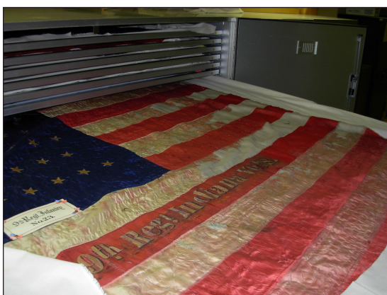
Above are two of the many flags in need of restoration. The top flag is the 123rd Regiment flag and below that is the national flag of the 9th Regiment.

said. “Some are potato chips. But we have the technology to fix them.”