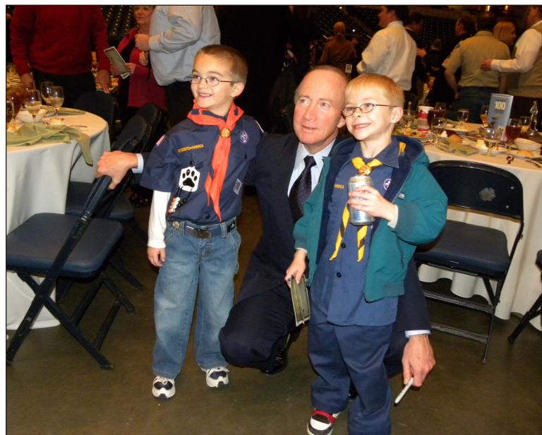
Governor Daniels meets with two Cub Scouts at the recent Crossroads of America Council’s Governor’s Luncheon for Scouting.