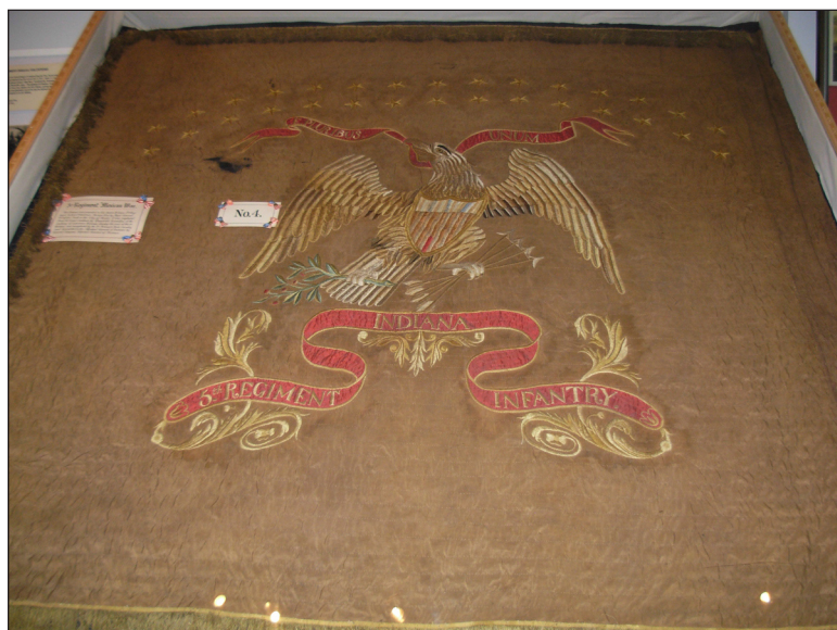
The 5th Regiment flag from the Mexican War is on display at the Indiana War Memorial after restoration.

Goodwin has a textile conservator from Purdue that has worked on the 10 flags that have been restored, including the current restoration of the two flags of the 19th Regiment. With some additional funding, more flags can be restored.