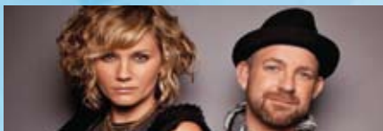
SUGARLAND WITH SARA BAREILLES SAT. AUGUST 13 - 7:30 PM