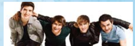
BIG TIME RUSH THURS. AUGUST 11 - 6:30 PM