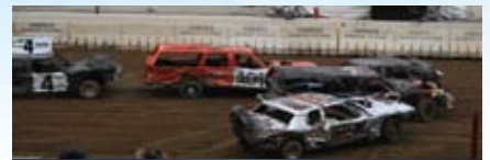
LUCAS OIL DEMO DERBY SUN. AUGUST 21 - 4:30 PM LAST BLAST FIREWORKS

Get your Hoosier Lottery Grandstand concert tickets at the Indiana State Fair Box Office (317) 927-7601, all Ticketmaster locations, ticketmaster.com or charge-by-phone at 1-800-745-3000.