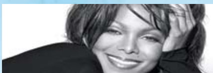
JANET JACKSON WED. AUGUST 17 - 7:30 PM