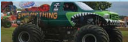
THE E3 MONSTER TRUCK NATIONALS PRESENTED BY LUCAS OIL SAT. AUGUST 6 - 1 & 7 PM

YEAR OF 2011 SOYBEANS PRESENTED BY INDIANA SOYBEAN FARMERS