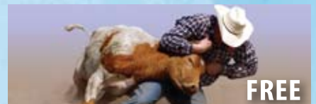
HOOSIER RODEO SERIES FINALS 2011 MON. AUGUST 15 - 1 & 7 PM