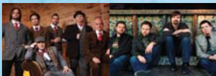
MERCYME & THIRD DAY WED. AUGUST 10 - 7:30 PM