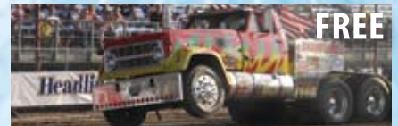
LUCAS OIL INDY SUPER PULL SUN. AUGUST 7 - 1 & 7 PM