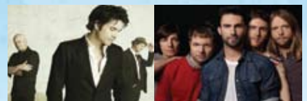
TRAIN & MAROON 5 WITH GAVIN DEGRAW THURS. AUGUST 18 - 7:30 PM