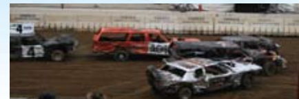
LUCAS OIL DEMO DERBY SUN. AUGUST 21 - 4:30 PM LAST BLAST FIREWORKS

Get your Hoosier Lottery Grandstand concert tickets at the Indiana State Fair Box Office (317) 927-7601, all Ticketmaster locations, ticketmaster.com or charge-by-phone at 1-800-745-3000.