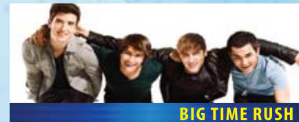
BIG TIME RUSH THURS. AUGUST 11 - 6:30 PM