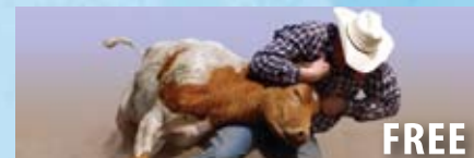
FREE HOOSIER RODEO SERIES FINALS 2011 MON. AUGUST 15 - 1 & 7 PM