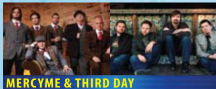
MERCYME & THIRD DAY WED. AUGUST 10 - 7:30 PM