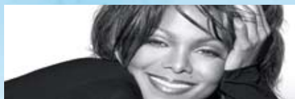
JANET JACKSON WED. AUGUST 17 - 7:30 PM