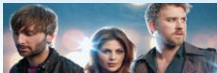
LADY ANTEBELLUM FRI. AUGUST 19 - 7:30 PM

It's the 2011 Indiana State Fair and this year it's more exciting than ever. It's the home of the hottest acts, the tastiest food, biggest midway, and the coolest animals all at the lowest prices! It's 17 days of fun, flavor and family memories. Don't miss it. Make your plans now to be a part of something truly INCREDIBLE!