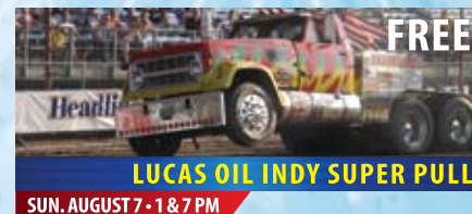
FREE LUCAS OIL INDY SUPER PULL SUN. AUGUST 7 - 1 & 7 PM

YEAR OF SOYBEANS ★ 2011 PRESENTED BY INDIANA SOYBEAN FARMERS