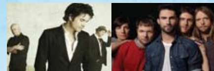
TRAIN & MAROON 5 WITH GAVIN DEGRAW THURS. AUGUST 18 - 7:30 PM