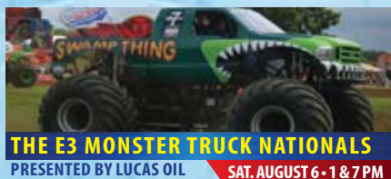
THE E3 MONSTER TRUCK NATIONALS PRESENTED BY LUCAS OIL SAT. AUGUST 6 - 1 & 7 PM