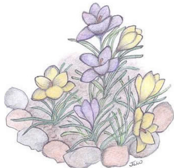
Original artwork by Jerry Williams

It is also a good time change batteries in your smoke and carbon monoxide detectors.