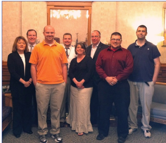
Following a successful Biggest Loser contest, the participants from the Auditor's Office agree to a group photo.