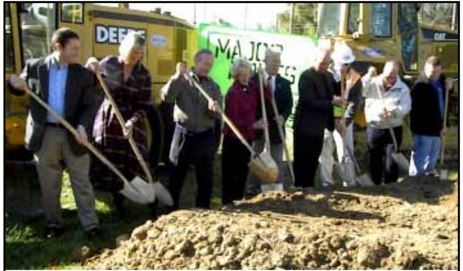
Governor Daniels joins the Indiana Department of Transportation and local elected officials for a groundbreaking event celebrating the beginning of the State Road 261 expansion project.

All correspondence must be sent to the Lt. Governor's office or ordered on enGreet's website by Nov. 18, as mail takes several weeks to reach the troops. Visit www.in.gov/lg and click on the "Hoosier Cheer For Our Heroes" link to learn more about the campaign and mailing instructions.