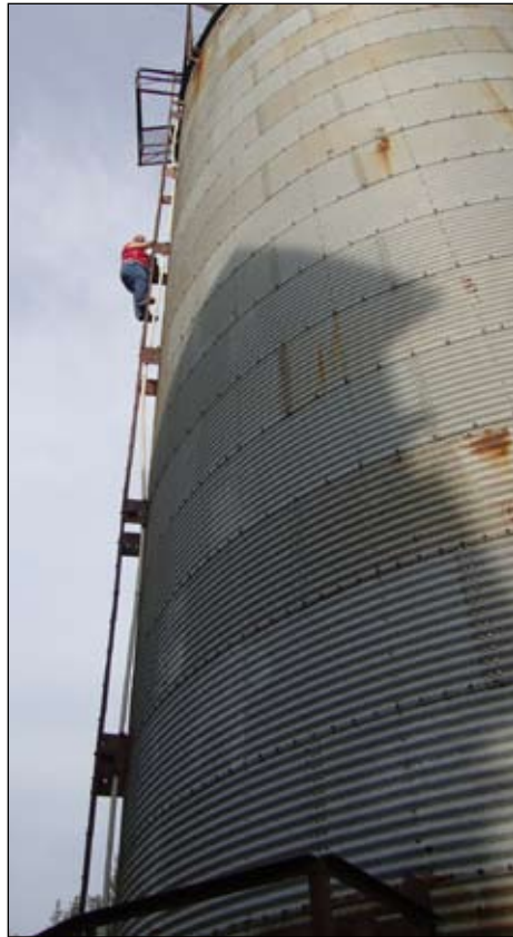
Aimee Fiesbeck makes climbs like this all of the time in her job as an auditor with ISDA.

"My numbers should match up to theirs," Fiesbeck said. "I'm verifying their numbers are accurate. I make sure they have enough grain to cover storage