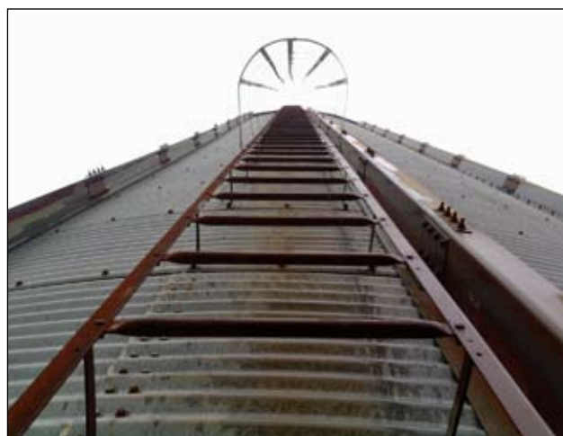
The view from the ground looks a tad daunting, that is if heights aren't your thing.