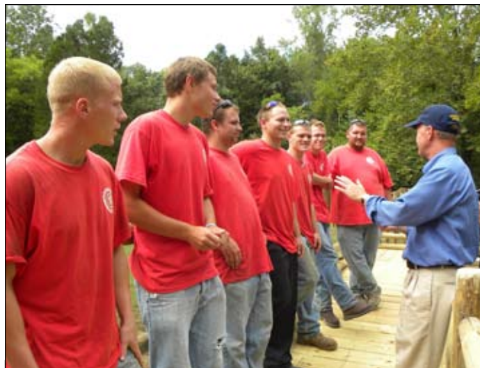
Governor Daniels meets with members of the Young Hoosiers Conservation Corps (YHCC) at O'Bannon Woods State Park. The YHCC program provides opportunities for students to work with the Department of Natural Resources to revitalize historic buildings, create and rehabilitate trails and restore acres of natural habitat.

Try incorporating this change into your daily routine. The difference you see and feel will spark other small changes that could lead to healthier, happier living.